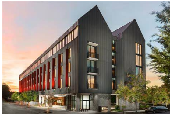
HOTEL INDIGO 500 COLLEGE AVENUE ATHENS, GA