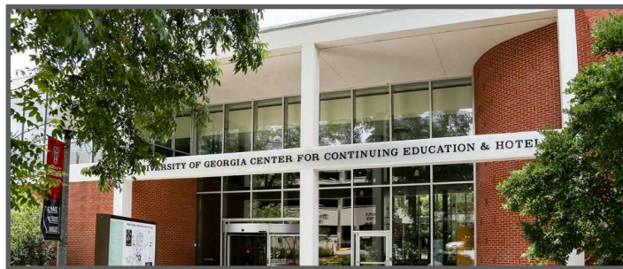
UNIVERSITY OF GEORGIA CENTER FOR CONTINUING EDUCATION AND HOTEL 1197 S. LUMPKIN STREET ATHENS, GA

A limited number of discounted rooms will be available if booked before January 29, 2024